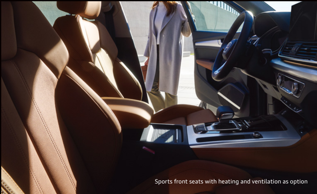
Sports front seats with heating and ventilation as option