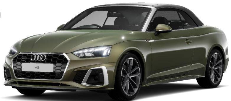
Illustrated A5 Cabriolet is painted in District Green (M4). Equipped with grey soft top (SW) and optional 19" alloy wheels, 5-spoke Cavo (S-design), graphite grey, high sheen (V89)