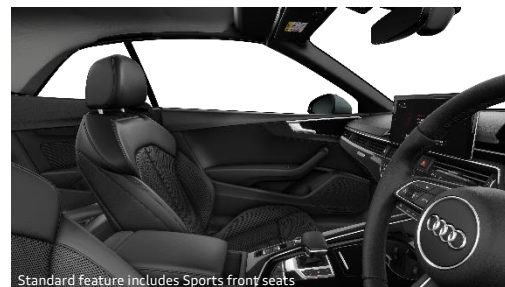
Standard feature includes Sports front seats

2-Year Unlimited Mileage Warranty 12 years body anti-rust warranty