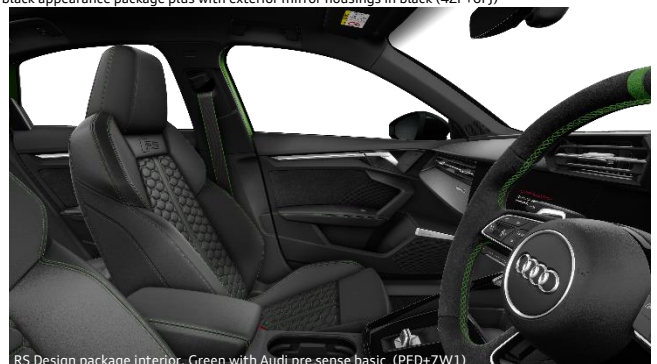
RS Design package interior, Green with Audi pre sense basic (PED+7W1)

Illustrated RS3 Sedan equipped with optional W1A package + 19" wheels, 5 spoke-Y-style, black with graphic print (S2V), and RS Design package interior, Green with Audi pre sense basic (PED+7W1) and black appearance package plus with exterior mirror housings in black (42P+6F)