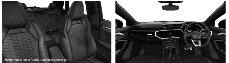
Interior: Black-Black/Black-Black/Black/Black (QH)