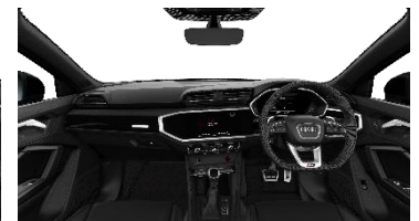
Interior: Black-Black-Express Red/Black-Black/Black/Black (AR)