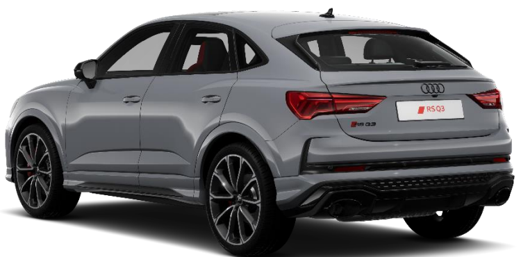
Illustrated RS Q3 Sportback equipped with optional Black Styling Package (4ZP+PAH+6FJ) + 21" Alloy wheels, 5-V-spoke polygon style (44Z) black with graphic print (52V)