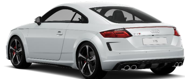
Illustrated TTS Coupé quattro equipped with optional Black Styling Package (4ZD) + 19" Audi Sport wheels, 5-spoke blade, Black, high sheen (45V)