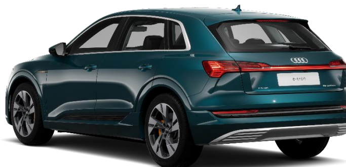
Illustrated e-tron 55 quattro equipped with 20" wheels, 5-arm dynamic design (F08)